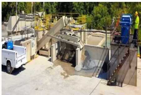
Chart-1 Batching Plant of Great Wall Construction

Specifications for mixing water used in the production of hydraulic cement concrete ( American Society for Testing and Materials,2006) and the EN standard for mixing water for concrete (European Committee for Standardization, 2002), there are optional limited values of maximum concentration in the mixing water for chloride, sulfate, alkalis and total and total solids by mass.