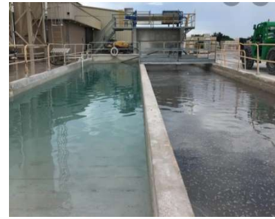
Chart-2 Concrete Waste Water Tank of Great Wall Construction

Myanmar is mainly an agricultural and developing country. Moreover, our country Myanmar is mainly description for rural development, transportation is also important fort. Being the developing country, we have to use concrete for urbanization and industrialization which are the impetus for economic growth, large quantities of industrial wastewater are equally generated. Different researchers had characterized the nature of wastewater generated in Myanmar.